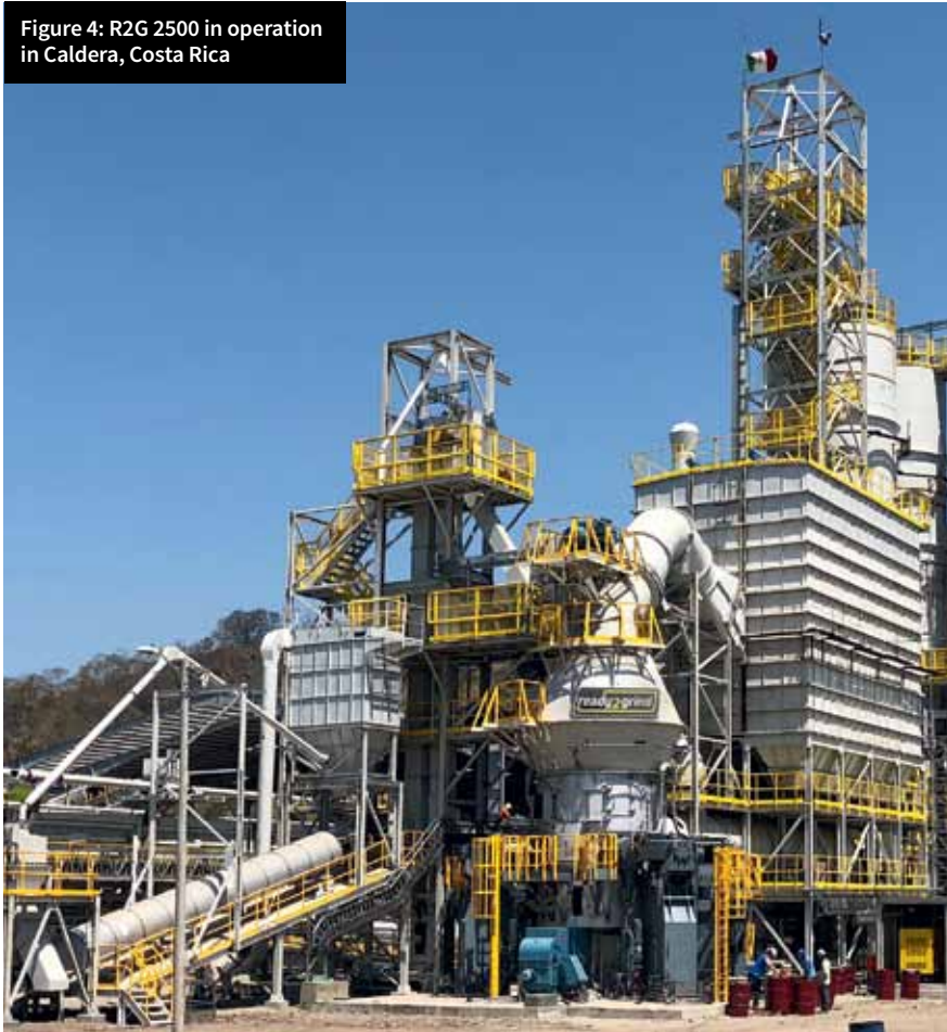
Figure 4: R2G 2500 in operation in Caldera, Costa Rica