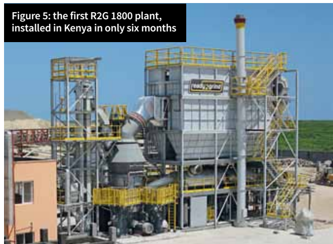
Figure 5: the first R2G 1800 plant, installed in Kenya in only six months

Following these initial successes, a further four plants are currently being manufactured and are scheduled for delivery later this year. Three plants have already been delivered and are expected to start installation soon. ■