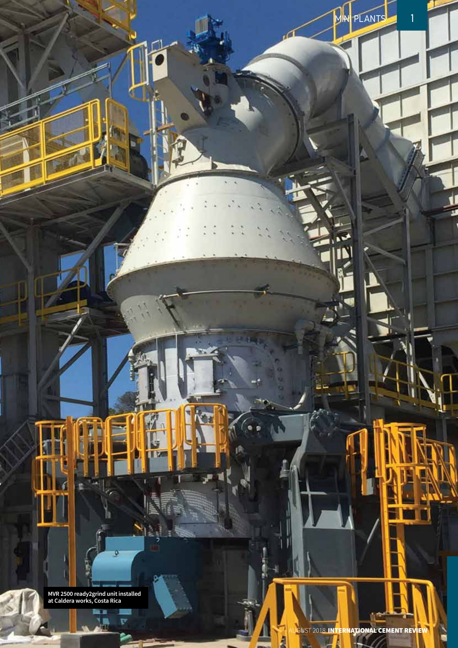
MVR 2500 ready2grind unit installed at Caldera works, Costa Rica