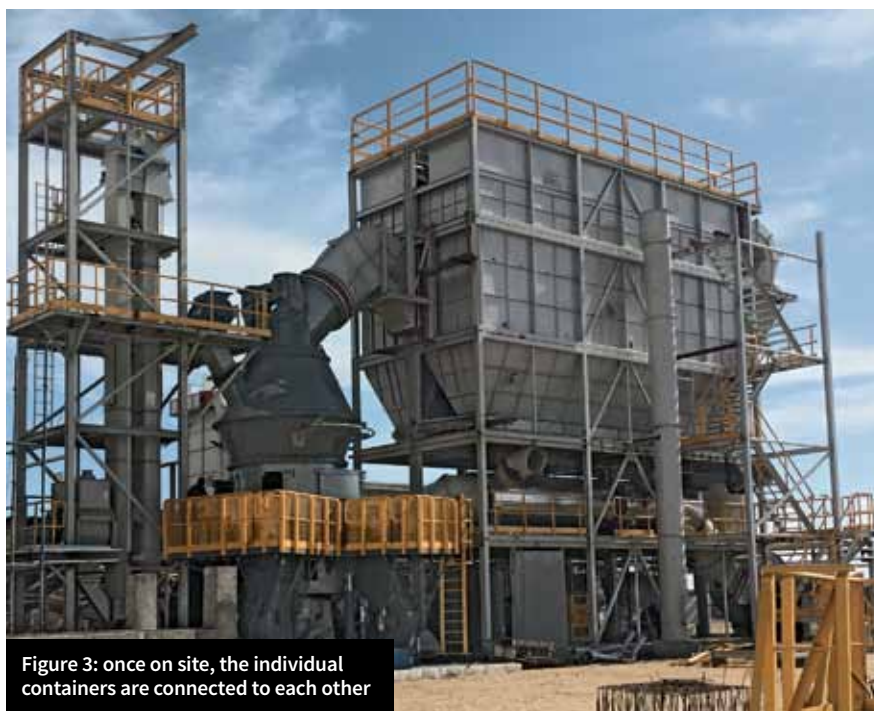
Figure 3: once on site, the individual containers are connected to each other

this saves a time-consuming step during installation and minimises the risk of delays due to bad site conditions, lack of staff or time-consuming reworking. Following commissioning by a staff member of Gebr Pfeiffer, the plant can be controlled on the spot with the easy-to-handle operator station.