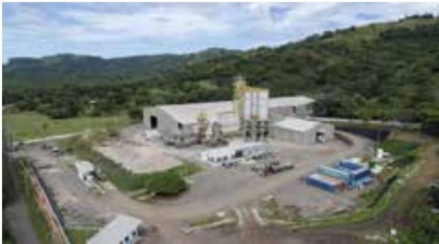
Figure 4: ready2grind plant equipped with an MVR 2500 C-4 mill in Costa Rica

The installation sizes vary from 20 up to more than 90 t/h. The most common ready2grind plant type is the R2G 2500 C-4 with a production rate from 50 to 79 t/h of cement, depending on composition and product fineness. Figures 4 and 5 show pictures of ready2grind plants with MVR 2500 C-4.