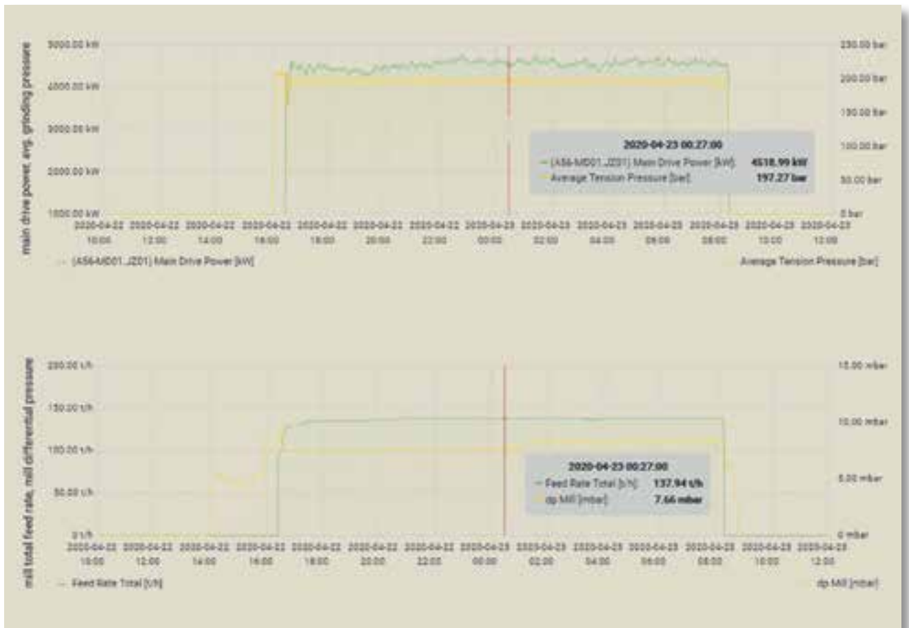
Figure 7: Exemplary screenshot of data transmitted by GPpro system

Raw material grinding with MVR mills is also very common and proven in the field worldwide. Latest installations with MVR 5000 R-4 mills are located in Uzbekistan (► Fig. 6) and North Africa. One MVR 5000 R-4 mill produces a throughput of nearly 360 t/h of raw meal at 12 % residue on 90 micron with a specific power consumption of the mill of 9.5 kWh/t whereas another MVR 5000 R-4 mill grinds a raw material mix of better grindability to the same fineness that results in a throughput of 433 t/h at 7.0 kWh/t.