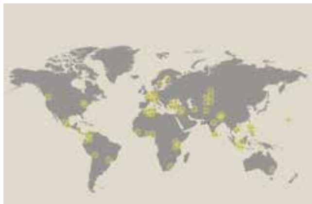
Figure 1: World map with MVR mills

The installed power of vertical roller mills was previously limited due to the design of traditional planetary gearboxes. With the development of a new modular drive system the installed power was upgraded to a much higher level. The MultiDrive® was launched with the MVR mill in 2010. The mill