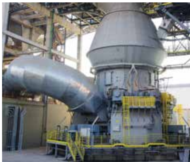
Figure 2: MVR 6700 C-6 mill with MultiDrive®

is driven through a girth gear flanged to the grinding bowl by up to six actively redundant drive units with a total installed power of up to 18000 kW (▶ Fig. 2). Each drive unit consists of an electric motor, coupling and gear unit. The grinding forces are transmitted to the foundation via a conventional plain bearing without placing any loads on the gear units. Therefore, the gear units are not exposed to the grinding forces. Both drives and gear unit can be removed individually from the system and the mill can continue to grind. Together with the rollers, which can also be taken out individually, the highest level of availability is achieved.