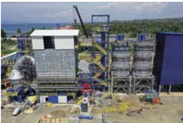
Figure 5: ready2grind plant with an MVR 2500 C-4 mill during erection in the Philippines