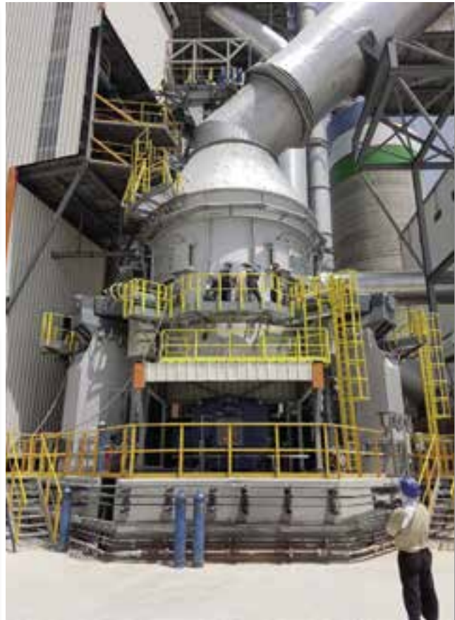
Figure 6: View of an MVR 5000 R-4 mill

Many MVR mills have been put into operation in recent years. Most cement manufacturers produce a wide range of products including the cement type CEM I and composite cements depending on available SCM. Table 2 lists the operational data of cements produced in MVR 3750 C-4 mills.