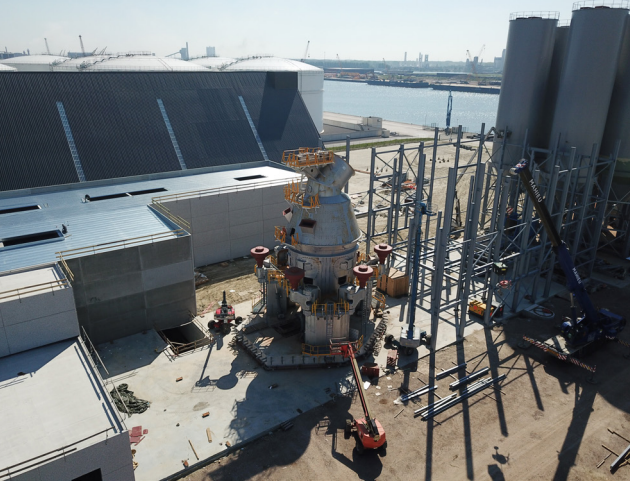
Figure 4. MVR 5300 C-6 under construction in Europe.