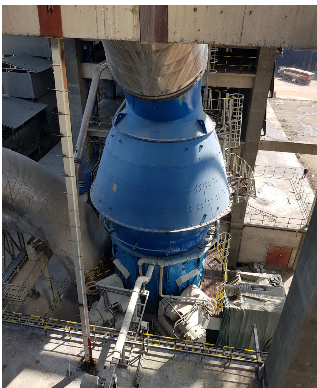
Figure 1. MVR 3750 C-4 in East Africa.

The running times that have now been achieved with completed plants and the satisfaction of the customers confirm the correctness of the chosen mill and drive system. The need for high plant availability and an optimised maintenance concept is becoming increasingly important.