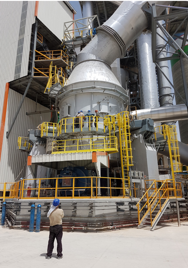
Figure 5. MVR 5000 R-4 under construction in Uzbekistan.

some pozzolanas, for example phonolith, can be increased by thermal treatment. By heating up to 300°C to 500°C, the crystal lattice expands and the surface area increases. Thereby the formation of hydrate-phases is supported. 3