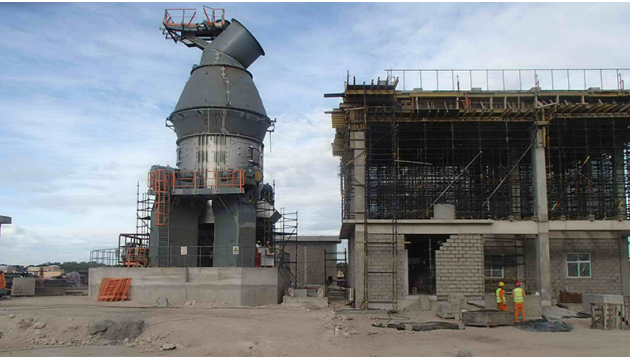
Figure 3. MVR 3750 C-4 under construction in South Africa.